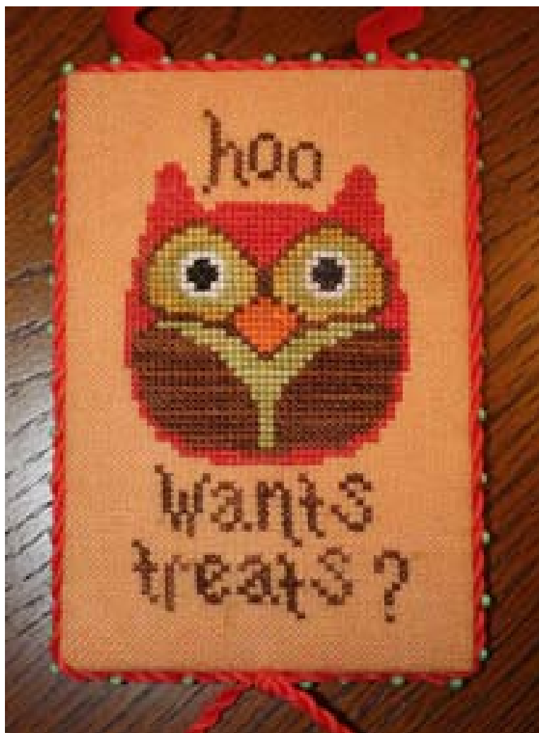
Hoo Wants Treats?